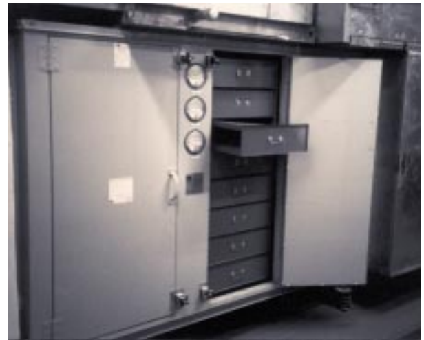
Typical USAH-404 filtration unit.

This customized service, supplied at no additional charge, not only provides a precise maintenance schedule, but also ensures the highest performance of the USAH Air Purification Systems installed at the George Bush Presidential Library and Museum.